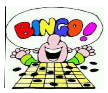
November 2nd, 9th, 16th and 30th

Tuesday, November 21st at 10:15 a.m. New members are welcome at any time. Suggestions on authors & books are gladly accepted. Large Prints Available